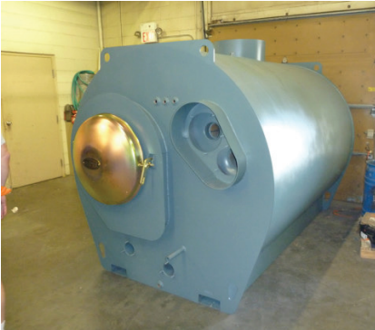
Garn boiler system.

The study served as a basis for installing high-efficiency wood boilers in public buildings in the communities of Igiugig and Kokhanok, which are highlighted in the case studies, and may still be used to support further projects in other communities. Iliamna, Newhalen, Nondalton, Pedro Bay and Port Alsworth are also examined in the report.