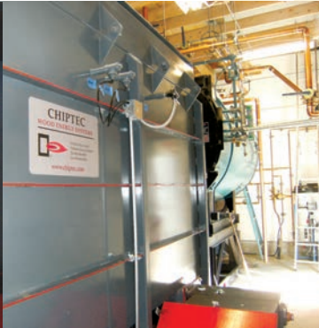
Garn boiler system.