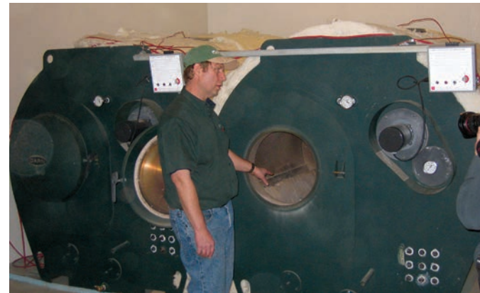
Dual Garn WHS 2000 boilers in Tanana.

The city obtains wood for the boilers by paying local woodcutters $250 per cord. Where the community used to buy diesel fuel and watch that money leave the village, it has now created an economic opportunity for residents that keeps the money local. There are plans to expand the system with three larger wood-fired boilers to heat tribal buildings and the senior citizen center.