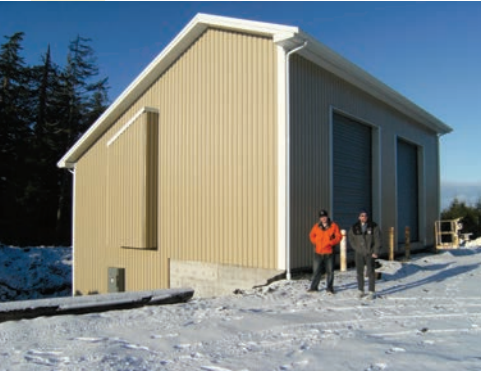
Garn boiler shed.

In 2004, the residents of Craig, a fishing community of 1,400 people located in southeast Alaska, looked at the heating bills for the local schools and swimming pool, and knew they needed to make a change. The boilers used 20,000 gallons of diesel and 40,000 gallons of propane annually. The monthly fuel bill for the three buildings was over $10,000.