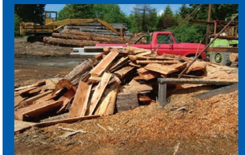
Wood scraps are prime material for wood boilers.

Harnessing the energy potential of Alaska's natural resources.