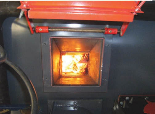
Garn flame.