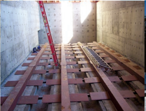
Craig wood chip dryer.